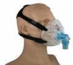
2 x 50 Face Masks