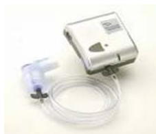
1 x Nebulizer