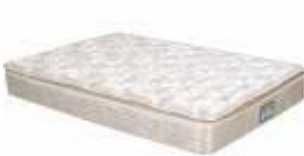
2 x Adult Mattress