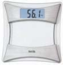
2 x Weighing Scale for Children