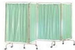
42 x Screens