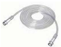
20 x 14ft Oxygen Tubing