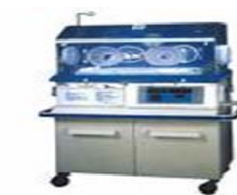
1 x Incubator