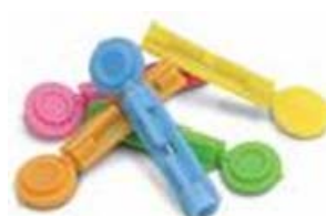
2 x 200 Lancets for Glucose Testing