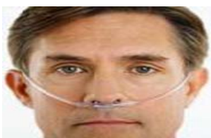
50 x Nasal Cannulae