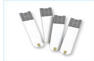
6 x 50 Glucose Test Strips