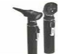
2 x Diagnostic Set