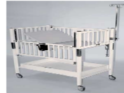
4 x Crib