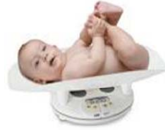
2 x Weighing Scale for Babies