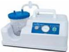
2 x Suction Machine