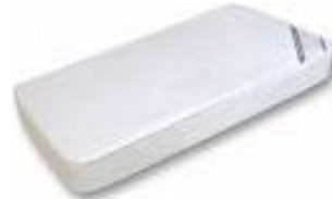
4 x Child's Mattress