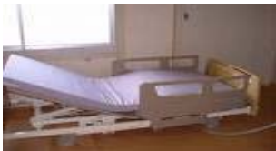
4 x Child's Hospital Bed