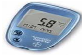
2 x Glucometer