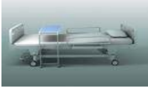
2 x Adult Hospital Bed