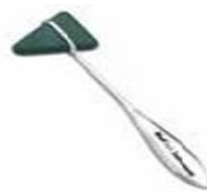
2 x Tendon Hammer