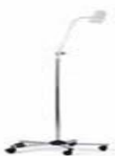
2 x Examination Lamp