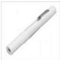
5 x Pen Torch