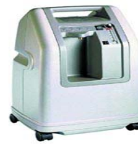
3 x Oxygen Concentrator