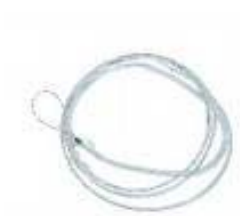
3 x 100 Nasogastric Tubes